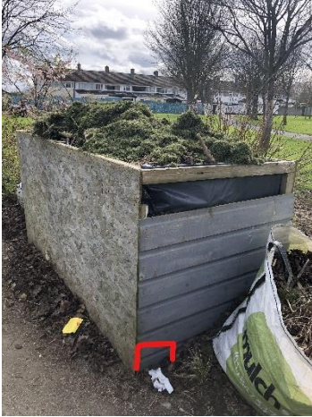
Compost pile in Bayside with a proposed 'hedgehog door' illustrated.