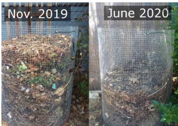
Example of a wire compost bin to hold leaves. Cut hole at bottom to let hedgehogs in and out. Leaves break down over time as you can see in picture.

The Irish Hedgehog Survey commenced in 2021 and is being co-ordinated by NUIG. It would be great for the garden users to link in with other local groups also participating in the Local Biodiversity Action Plan to complete a hedgehog survey. See https://www.irishhedgehogsurvey.com/ for further information.